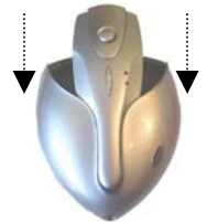
Figure 1. ezTalker inserted into charging cradle

BATTERY INDICATION: When the battery is low (less than 10% of capacity), the amber LED will flash and you'll hear a double beep every 32 seconds.